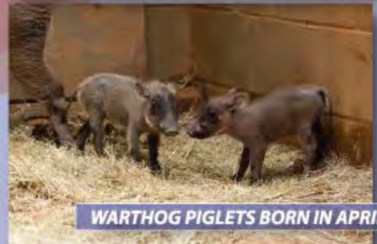
WARTHOG PIGLETS BORN IN APRIL