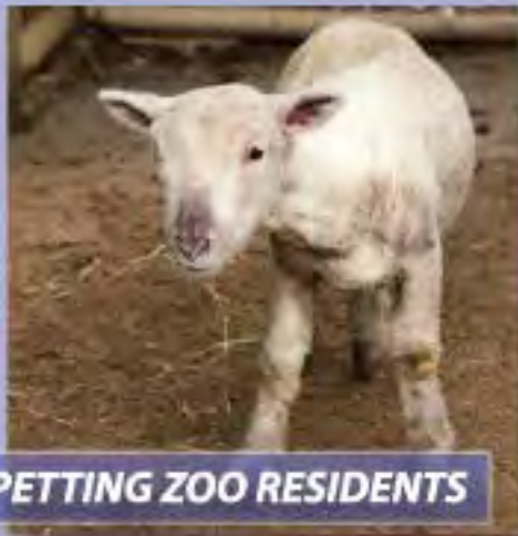
NEW PETTING ZOO RESIDENTS