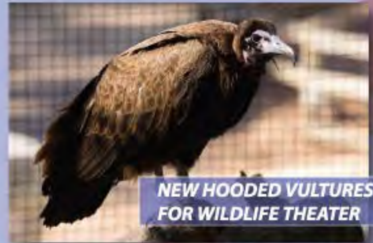
NEW HOODED VULTURES FOR WILDLIFE THEATER