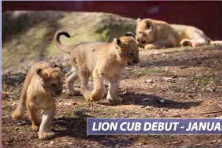
LION CUB DEBUT - JANUARY