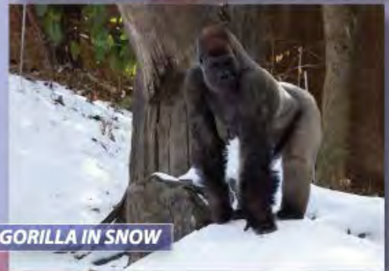
GORILLA IN SNOW