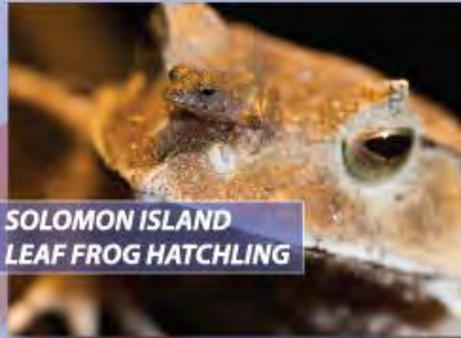
SOLOMON ISLAND LEAF FROG HATCHLING