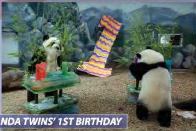
PANDA TWINS' 1ST BIRTHDAY